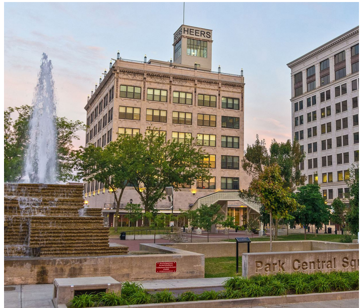
Downtown Springfield, Park Central Square

For those seeking higher education, there are many colleges and universities throughout the region, including Missouri State University, Ozarks Technical Community College, Drury University, Evangel University, and Southwest Baptist University.